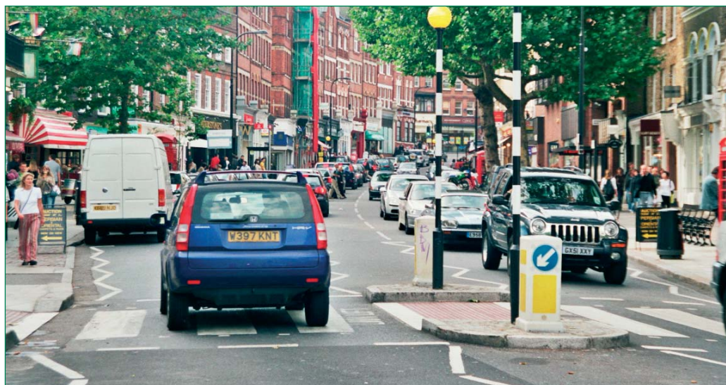
Zebra crossing on Hampstead High Street

This chapter covers design options for the carriageway, including layouts, traffic calming, crossings and carriageway markings. It also contains information on subjects that need more attention paid to them, such as drainage and materials. This section is intended to complement the Highway Works Contract and TSR&GD 2002, by providing clarity on preferred designs where variation is allowed.