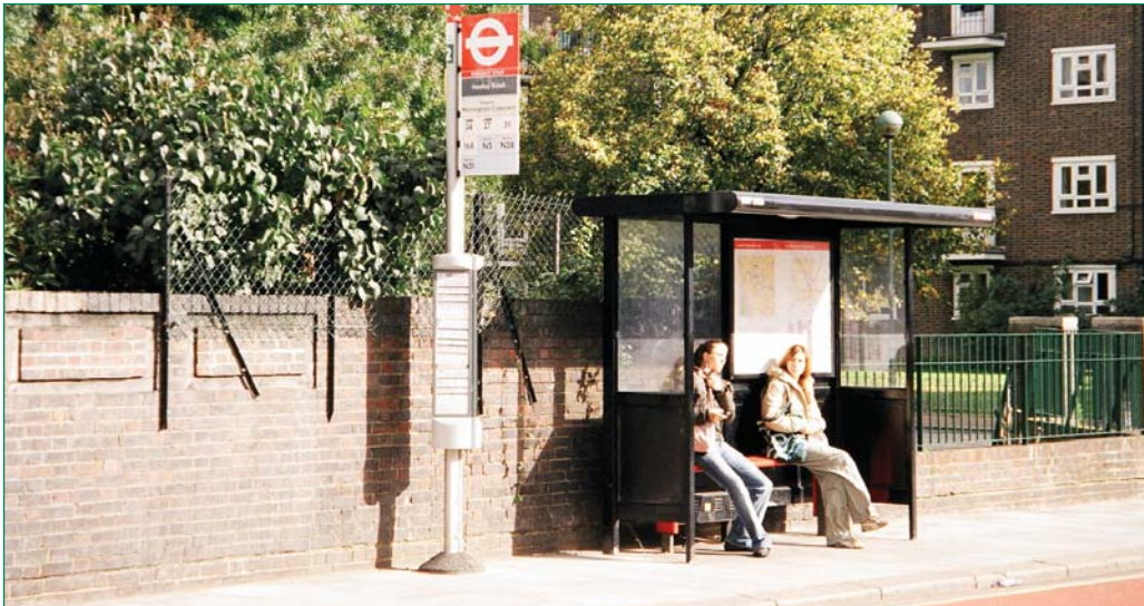
Bus shelter neatly positioned at back of footway

This chapter provides information on major items of street furniture and states preferred designs, colours and positions within the footway and carriageway. With the overarching aim of the manual being to reduce 'visual' street clutter, careful amalgamation, coordination and positioning of street furniture plays a major role in achieving this objective as well as reducing the 'palette' of materials in the street.