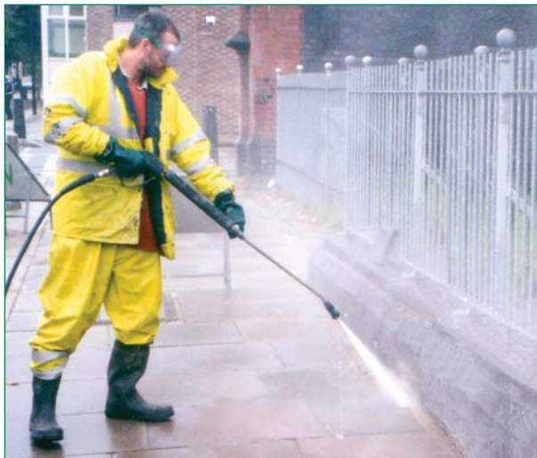
High pressure washing of Boulevard footway