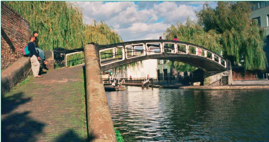
Regent's Canal at Camden Lock