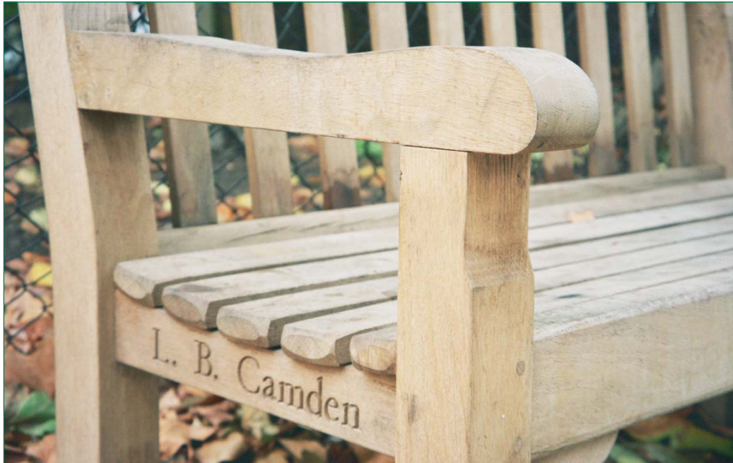
Wooden bench on the Jubilee Walk