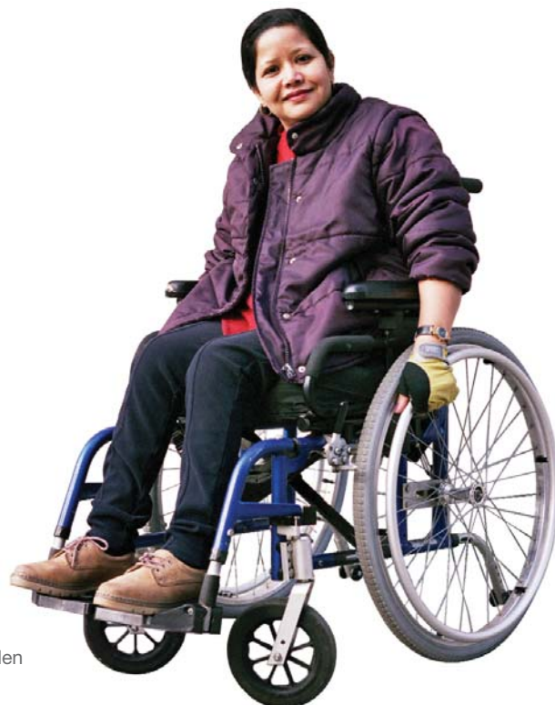
A wheelchair user in Camden