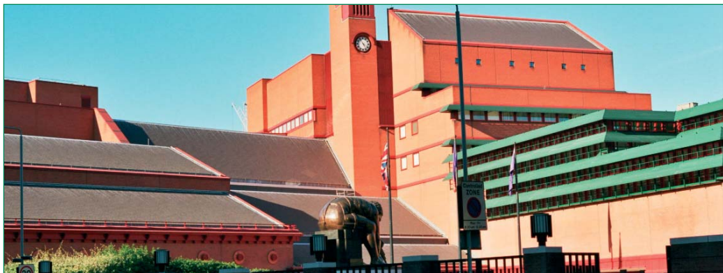
The British Library