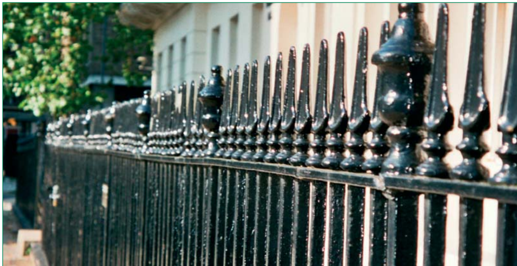
Tavistock Square railings