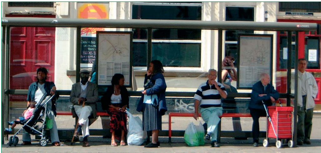
Waiting for the bus in Kilburn High Road