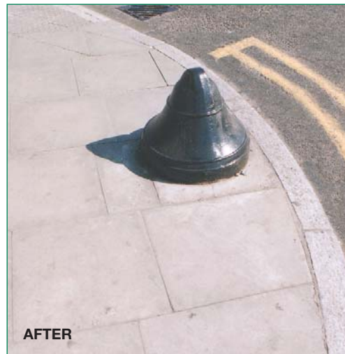
Boulevard improvements in England's Lane