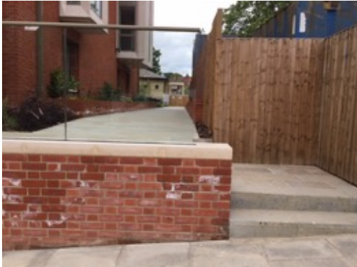
4 steps up from street