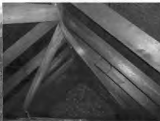
Fig. 2 Internal void- clean and tightfitting.