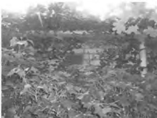
Fig. 1 Vegetation obscures extension wall