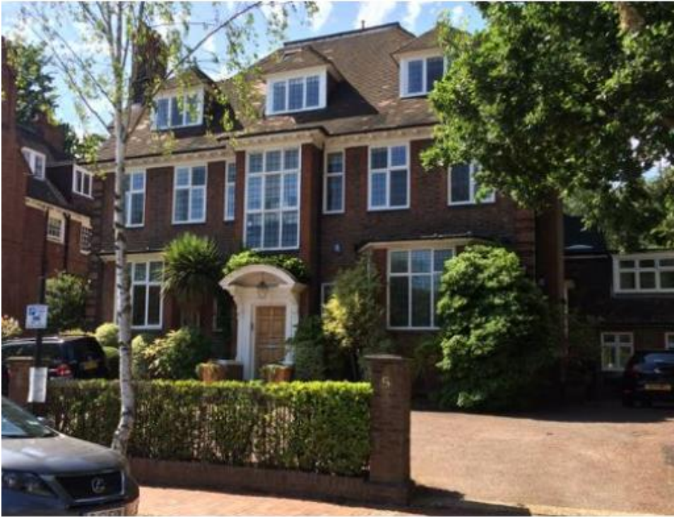
Photo 1 – Front elevation showing existing two storey side extension