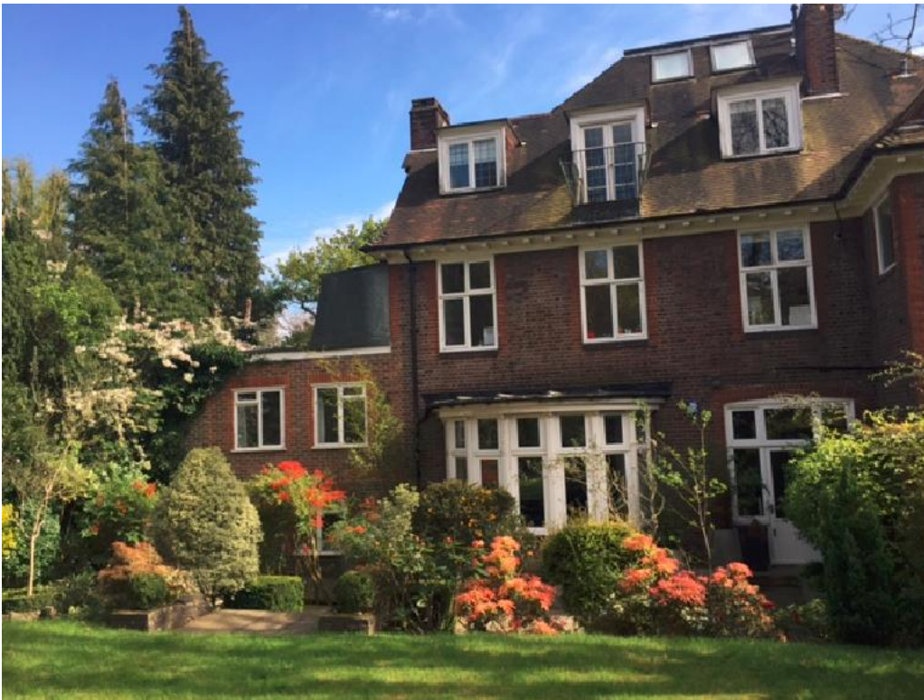
Photo 2- Rear elevation showing existing side extension