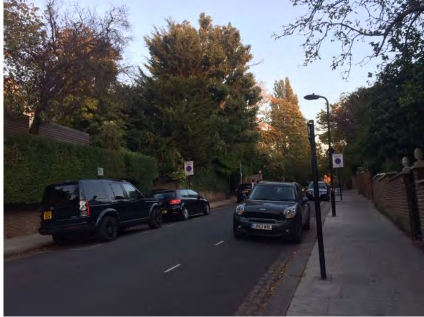
The view here is of larger and generously spaced houses set back behind dense vegetation, with views leading to the slopes of Hampstead.