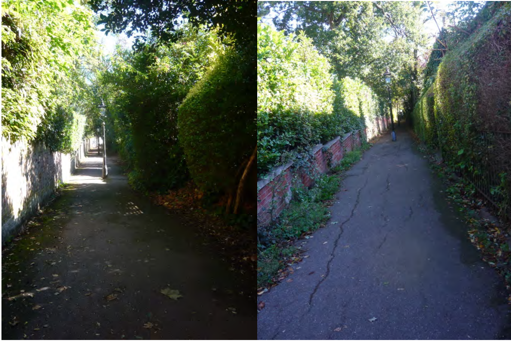
The pedestrian-only footway, with mature tall hedgerows on either side and ivy-covered walls and fencing, providing a sylvan aspect, prior to reaching the busy A41.