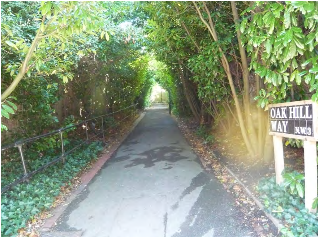
The steeply wooded slope is framed by mature evergreen shrubs, with distant views towards Branch Hill.