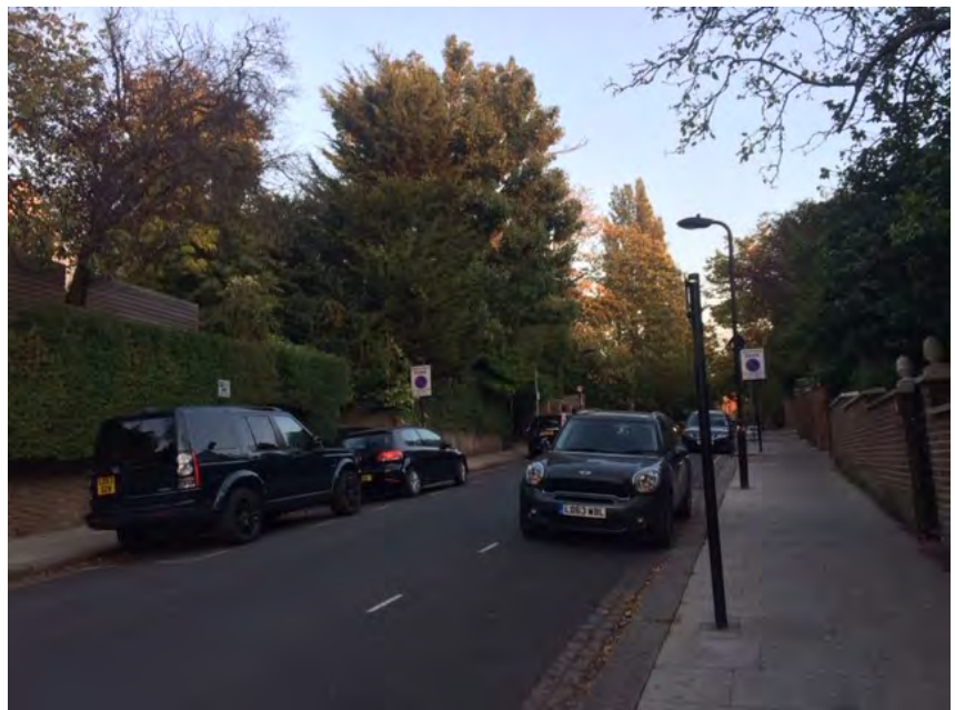
The view here is of larger and generously spaced houses set back behind dense vegetation, with views leading to the slopes of Hampstead.