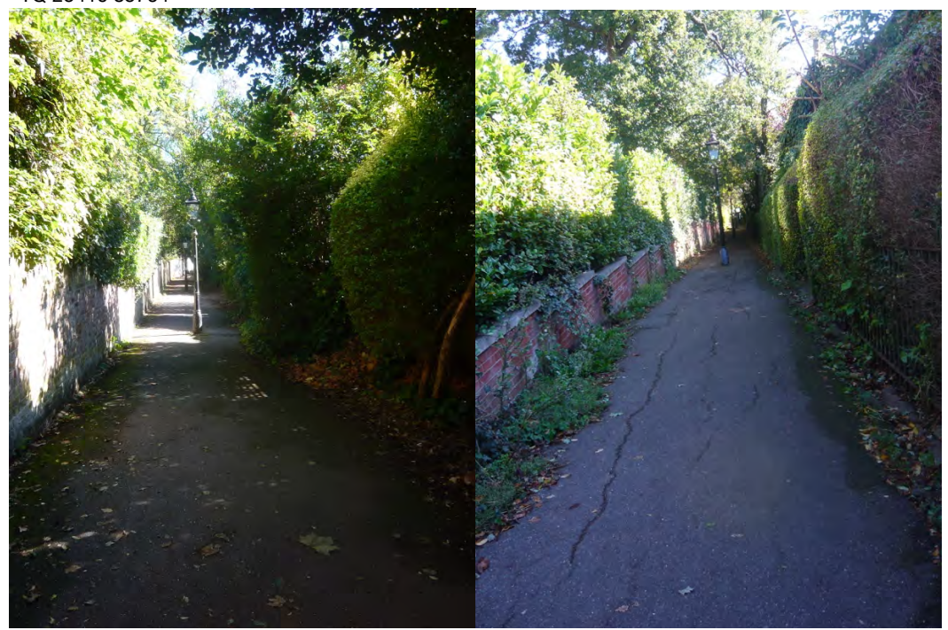
The pedestrian-only footway, with mature tall hedgerows on either side and ivy-covered walls and fencing, providing a sylvan aspect, prior to reaching the busy A41.

P and Q Key Views 16 and 17 Along Croft Way Ferncroft Avenue to Kidderpore Avenue and from Kidderpore Avenue to Finchley Road TQ 25419 85764