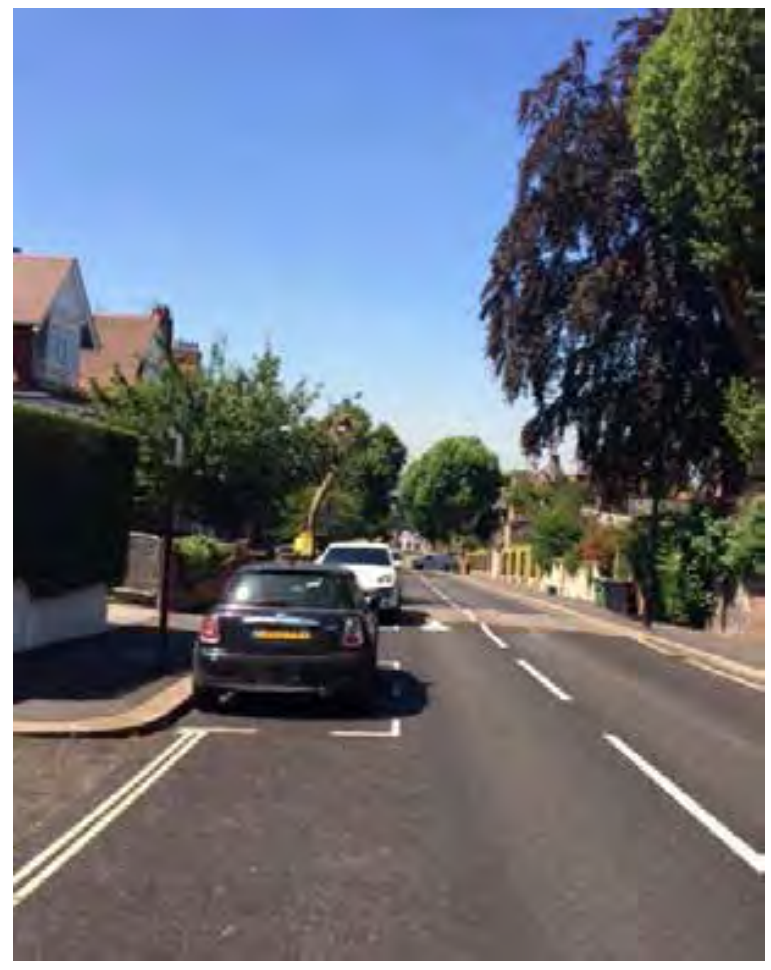
This view includes the domed Victorian roof and weathervane at 38 Arkwright Road (beyond the copper beech), the Grade II listed Camden Arts Centre at the north-western end of Arkwright Road (beyond the London Planes to the right of the photo). The view over to the western side of Finchley Road is compromised, and dominated by, the end elevation of the retail and housing block at 333-339 Finchley Road, demonstrating the need to protect views around heritage assets. The view leads down to Lymington Road and to West Hampstead.