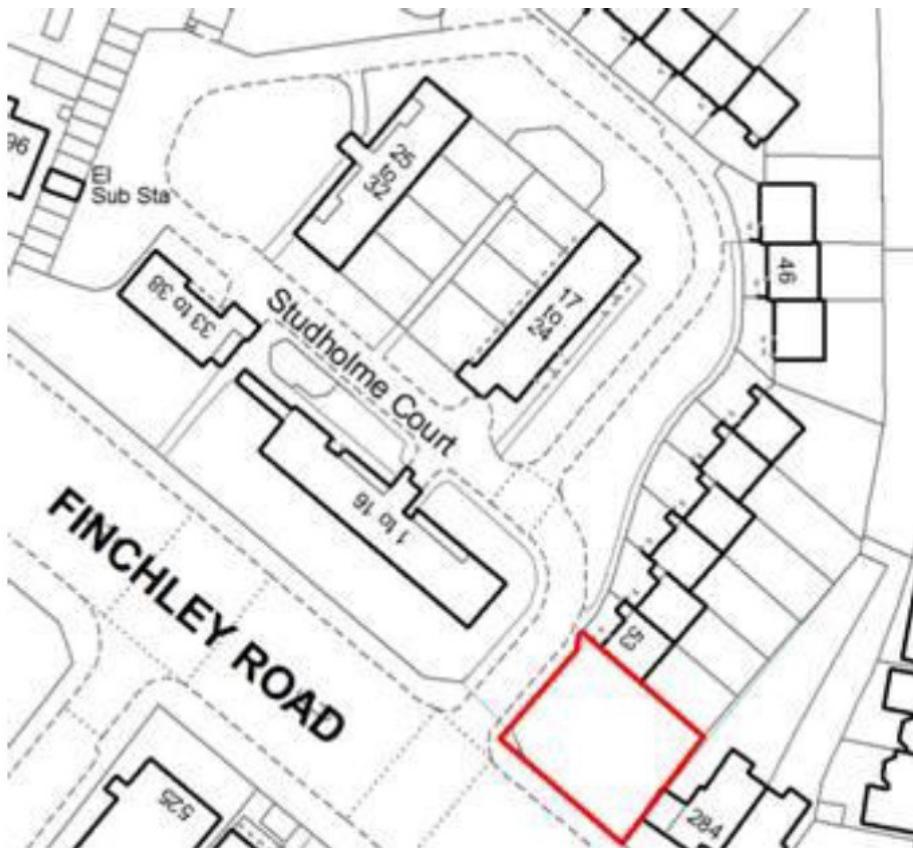
Studholme Court: Row of Ten Garages Backing onto Croft Way