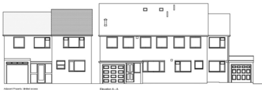
24 and 25-26 Redington Gardens: Proposed Elevation