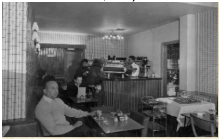
Association of Jewish Refugees

Cosmo Restaurant Interior, Finchley Road